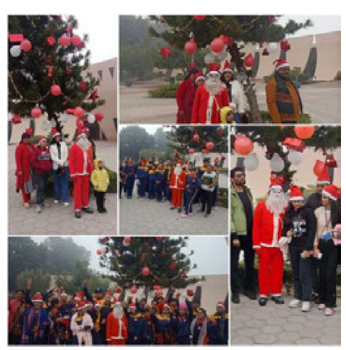
Christmas Day celebration at PGSC