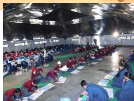
World Wetlands Day